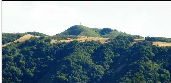
This is the view that most of us see.

In the event of an actual fire, the lookout determined its exact direction via a device known as an Osbourne Fire Finder. Similar to surveyor’s equipment, the finder used a topographic map centered on a horizontal table with a