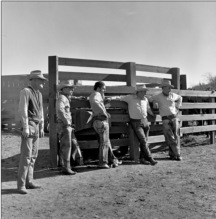
Carmel Valley Cowboys