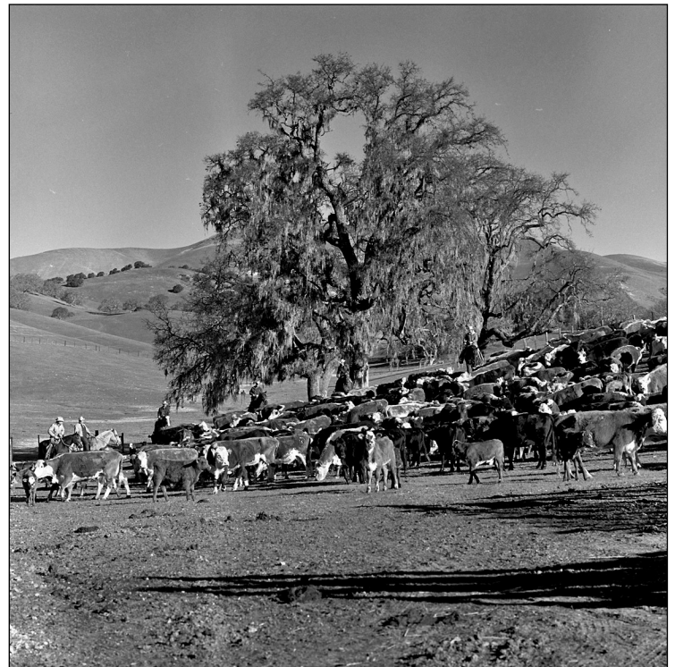
Carmel Valley Cows