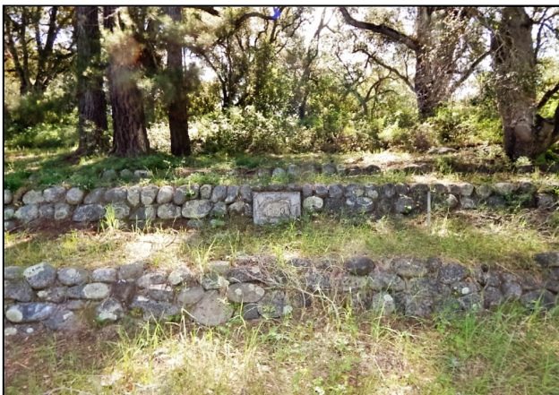
The only remnants that still exist are the stone terrace walls completed in 1960 – the firefighters who built them might now consider them a monument to the old Station

( Station, from page 1 ) metal buildings that were very hot in summer and freezing in the late fire season. Two of these metal buildings from the original site were repurposed on the Rana Creek Ranch.