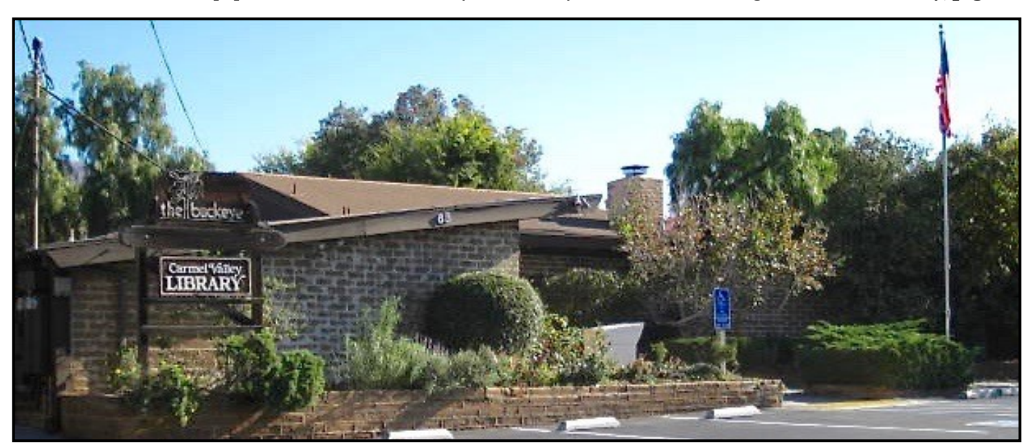
Carmel Valley Library, 65 W Carmel Valley Road

In the meantime, the library collection was stored in a temporary location known as the Box Stall. On January 28, 1949, books and furniture were installed in local Realtor Irene Baldwin's office building. The new space held her real estate office, the post office and the library. At this time the library's name was also changed, from (See Library, page 4)